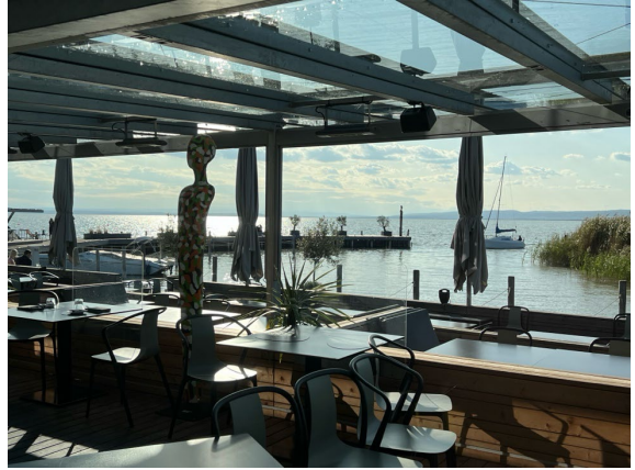
View from the new restaurant at the Weiden am See Resort over the lake