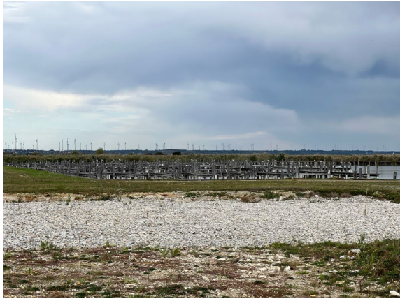
The old yacht harbour at Breitenbrunn Resort which will be rehabilitated as natural area