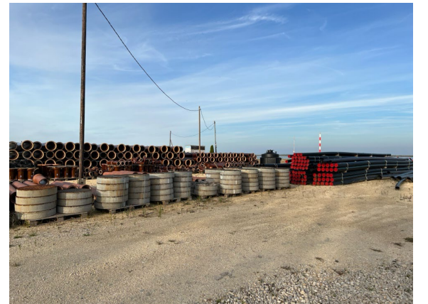
Elements for sub-surface infrastructure on site