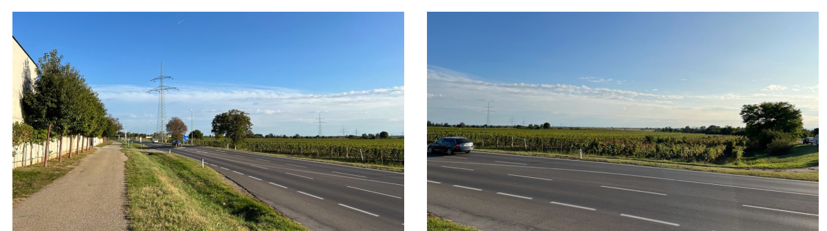
View along Route 51, looking southeast, with the proposed development site on the right

Current proposed hospital development site in the Wiesäcker, Gols