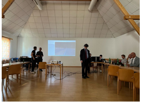
Virtual reality presentation