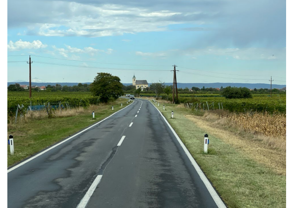
The L209 from Rust to Oggau am Neusiedler See