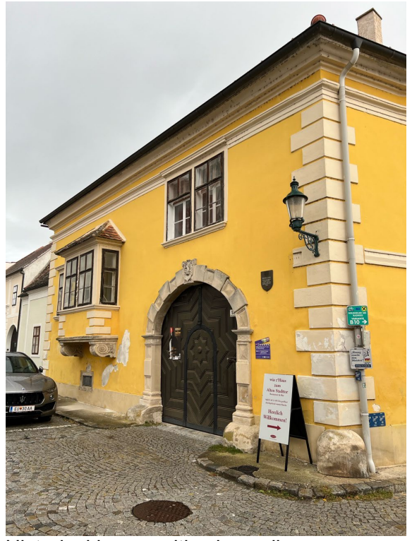
Historical house with wine cellar