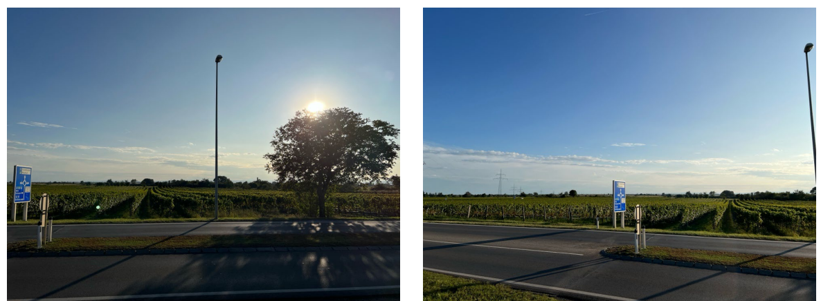
View over Route 51 looking over proposed development site