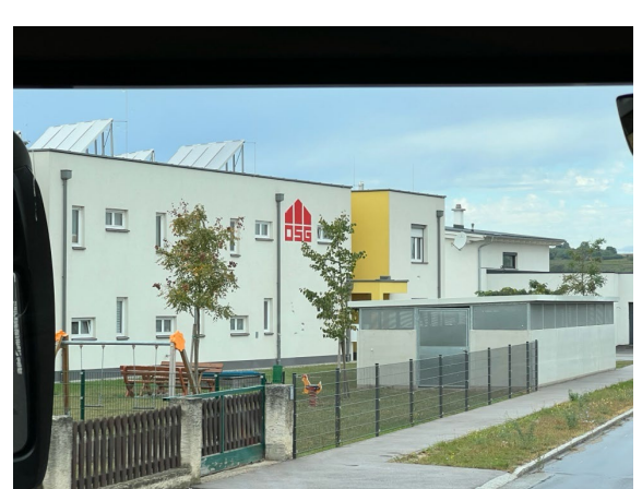
New housing at Rust, located in the property