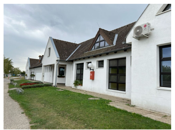
Existing buildings planned to be redeveloped