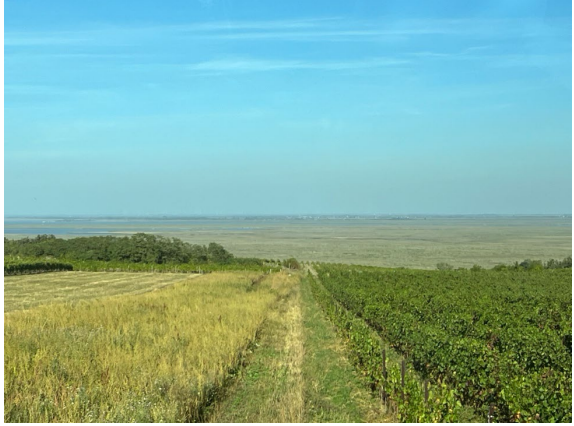
View from west eastwards over vineyards towards the lake in the Hungarian portion of the property