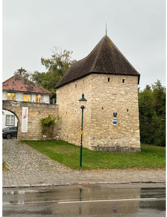
Mediaeval city wall and gate