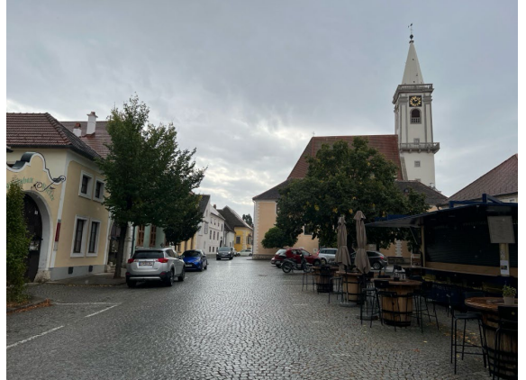
Typical streetscape: view towards the church