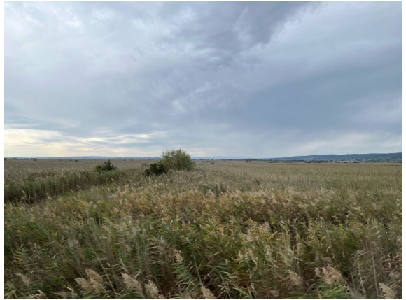
The reed bed at Breitenbrunn Resort