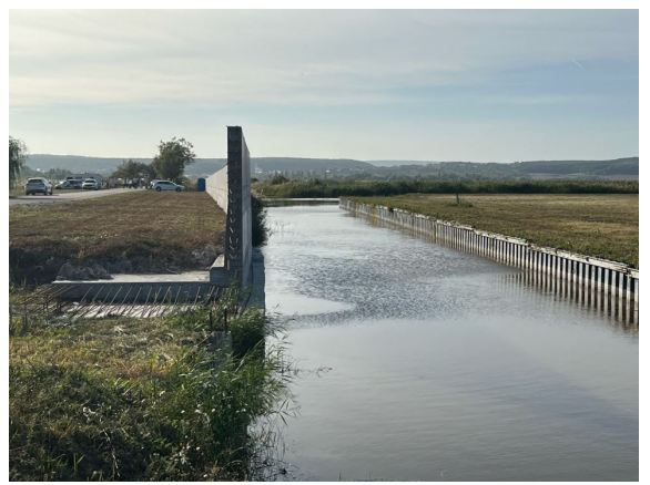
View from the redevelopment site towards Fertőrákos