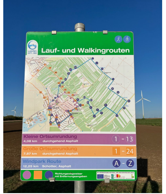
Public walking paths, including a so-called wind park route