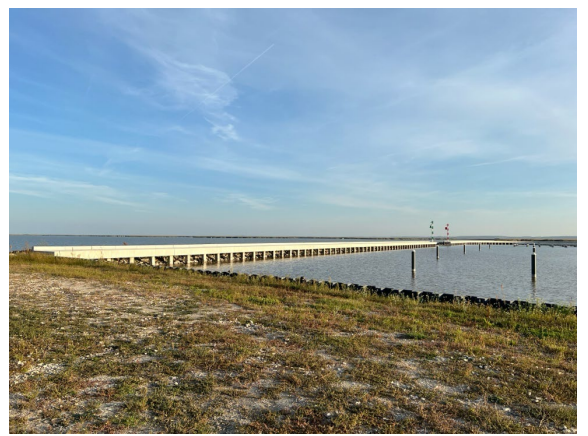
Future beach with concrete infrastructure