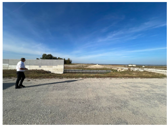
New concrete wall at the entrance to the redevelopment site