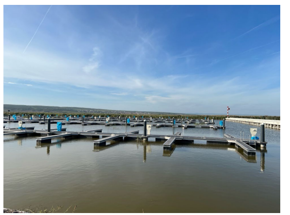
Northernmost harbour near completion