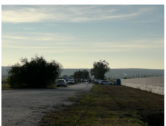
View of the road towards Fertőrákos seen from the redevelopment site