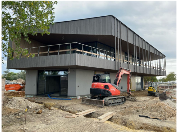
New restaurant building at Breitenbrunn Resort under construction