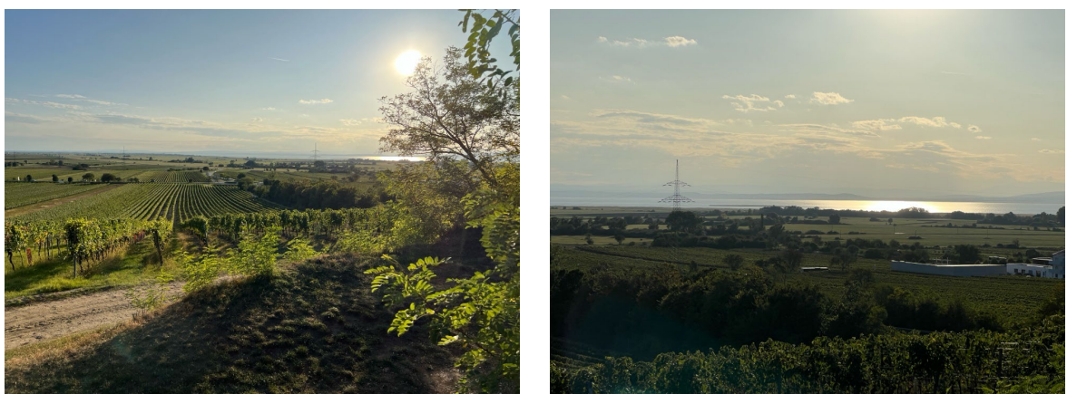
View towards the lake from the Aussichtsplattform, Gols, with the middle ground – the proposed hospital development site