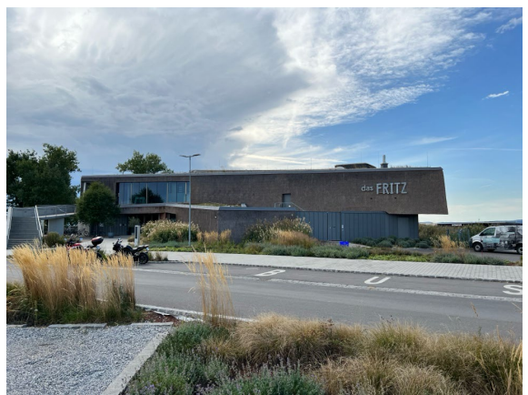
New restaurant at the Weiden am See Resort