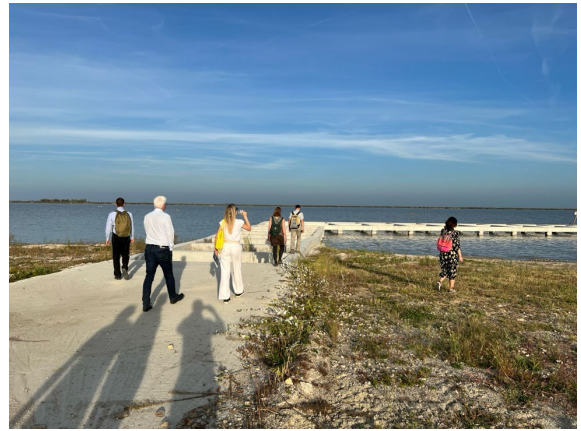
Future beach with concrete infrastructure