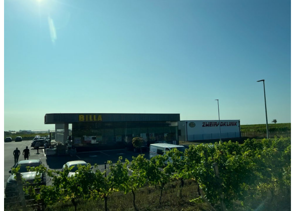
Shop constructed in vineyard landscape between Donnerskirche and Schützen am Gebirge