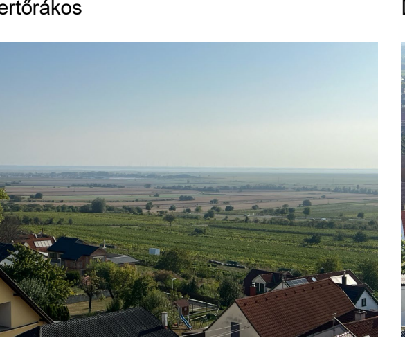
View from Donnerskirchen Church