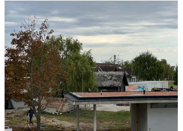
Breitenbrunn Resort as seen from the new restaurant building