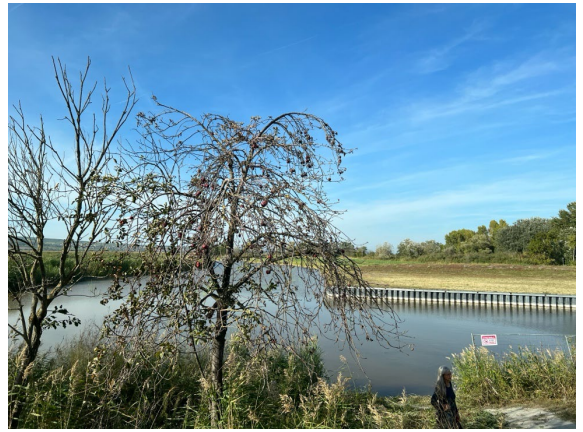
Canal dividing redevelopment site and reed bed separating Sopron-Fertő Lake Resort project site and Fertőrákos