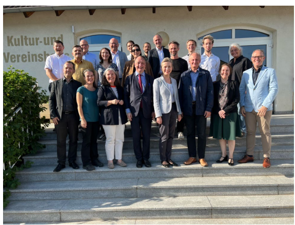
Mission team with both States Parties' representatives