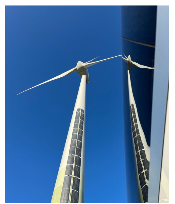
Experimental wind and solar power combination