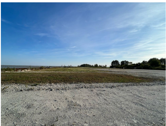
Redevelopment site looking south