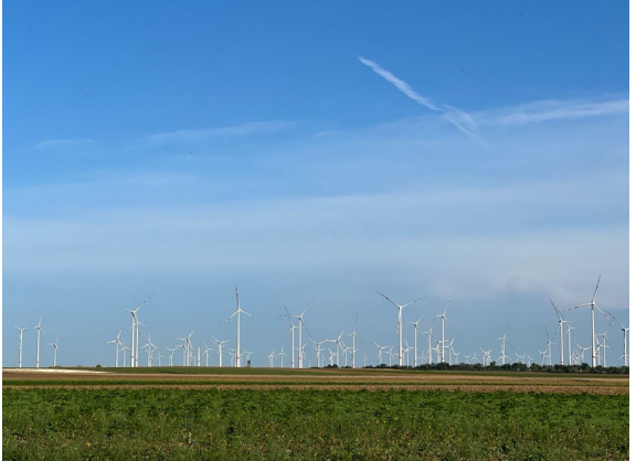
Wind turbines with, in the foreground, the bird flight path