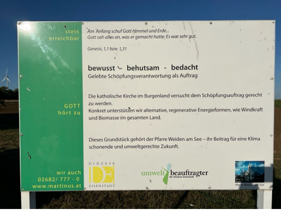
Sign indicating that the land on which the turbines are located belongs to the parish of Weiden am See