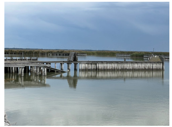
The old yacht harbour at Breitenbrunn Resort which will be rehabilitated as natural area