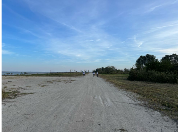
Redevelopment site looking south