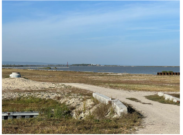
Redevelopment site with view northwards towards Möbish