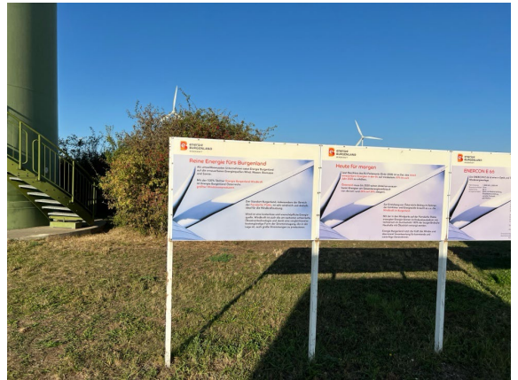
Information signage on the repowering project